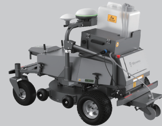
LM02 (Only Marking)